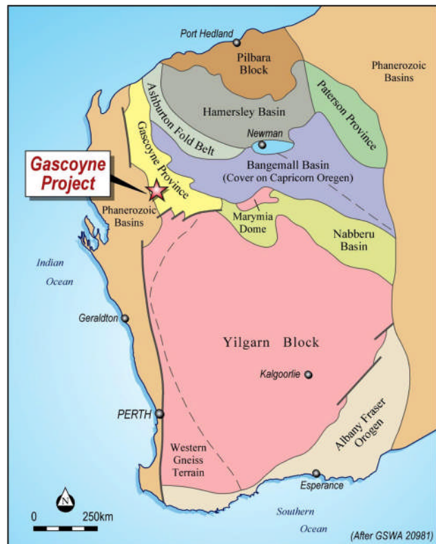
Figure 1 Gascoyne Project - Location Map

Audalia’s is targeting a Broken Hill Sedimentary Exhalative (SEDEX) massive sulphide Pb, Zn and Cu deposit.