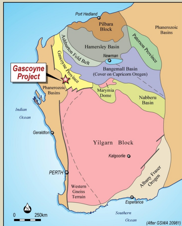
Figure 1: Gascoyne Project - Location Map

Audalia is targeting a Broken Hill Sedimentary Exhalative (SEDEX) massive sulphide Pb, Zn and Cu deposit.